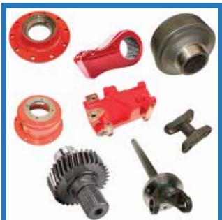
Spare Parts for Tractors