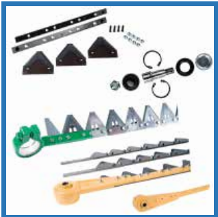
Assembled Knives and Components