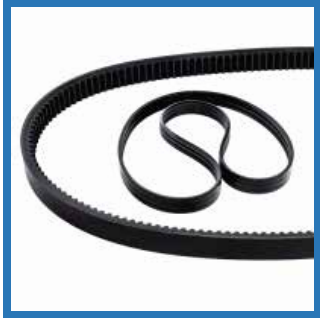
Trasmission and Conveyor Belts