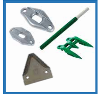
Spare Parts for Headers and Straw Discharge