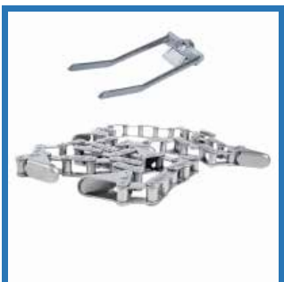
Spare Parts for other crop headers