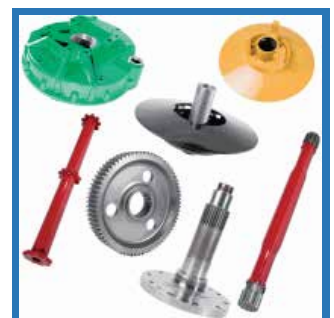
Drives for Combine Harvesters