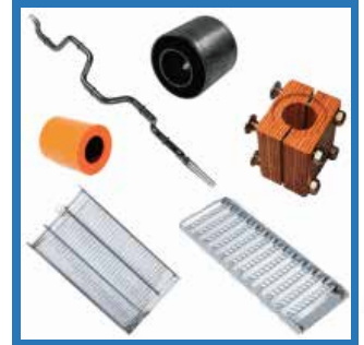
Separation and Cleaning Systems