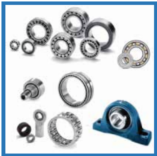
Bearings, Flanges, Supports and Bushings