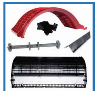
Feeding and Threshing Mechanisms