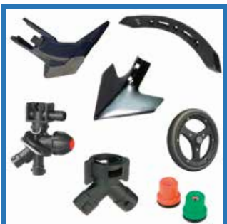
Spare Parts for Sowing and Irrigation Equipment