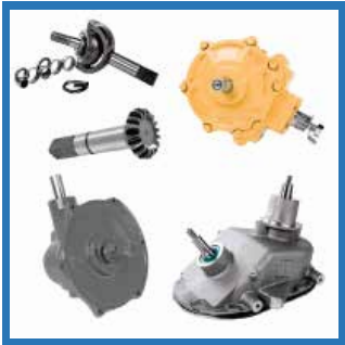
Complete Wobble Boxes and Repair Kits