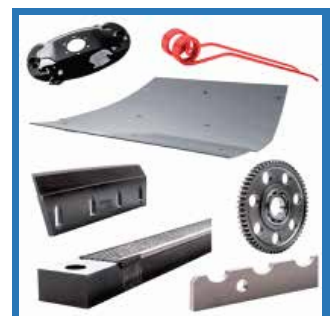
Spare Parts for Forage Harvesters and other Haymaking Machines