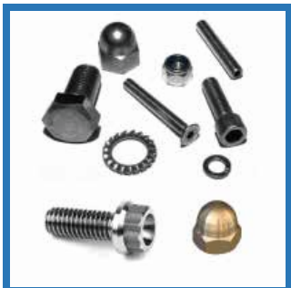
Screws, Nuts, Bolts, Washers, Circlips and Thorns