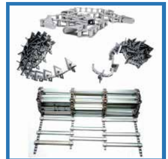
Chains and Components